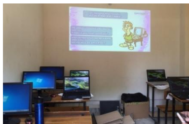
All equipment installed in the school