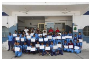
Happy School- 28th March

The numbers are growing with every passing year. 2014 saw 77 kids graduate, 2015 the number grew to 268. And this year we had 383 students graduate to get their certificate. The certificate distribution schedule was as follows