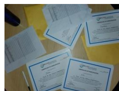
Certificates getting signed to be handed over to successful students