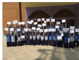
Sankalp School - 29th March