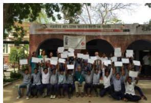
Middle School Sector 14 - 30th March