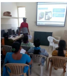
Train the Trainers for the Teachers to facilitate the lessons using self learning videos

This March we reached an important milestone. We took the first step in transitioning the computer education delivery to an automated delivery using self learning videos for which the facilitators need just 6 days training. This training can also be delivered through Skype for remote locations.