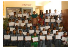
Choma Village - 31st March