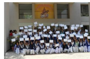
Sec. School-Chakkarpur 30th Mar