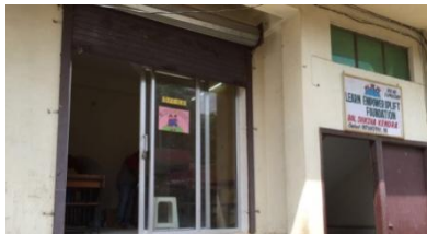
Bal Shiksha Kendra, at Harijan colony, Gurgaon