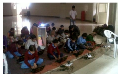
The Guru Learning Centre at DLF Phase I Gurudwara started with 1 batch of 25 children on 9 th January 2013. Now there are 57 children in two batches here.