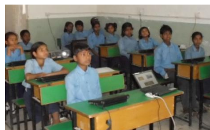
284 children started Computer lessons in two Sankalp schools on April 1, 2013.