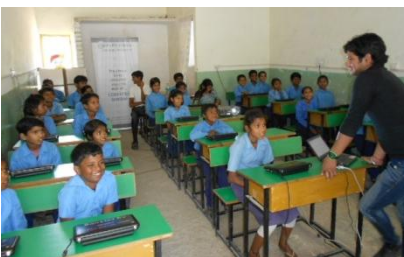
The first batch of children at Sankalp School, Sushant Lok. Class size 30. Batch size 137.

In the month of April 2013, Computer Shiksha started classes at two new schools in Gurgaon. These schools are run by the Sankalp Welfare Society . One school is in DLF Phase IV where lessons started on 1st April 2013 with 147 children and the other is in Sushant Lok where classes started on April 3, 2013 with 137 children. Before starting classes a test run was done on 30 th and 31 st March to ensure that there are no last minute technology glitches and the effort paid off. Classes started seamlessly on the designated dates without any hitches.