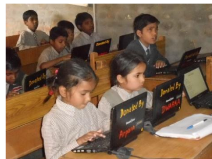
Children in Nai Kiran Universal school – Ardee City, Gurgaon. Computer Shiksha started with lessons for 60 children on 5 th May 2012. Now the number is up more than three times