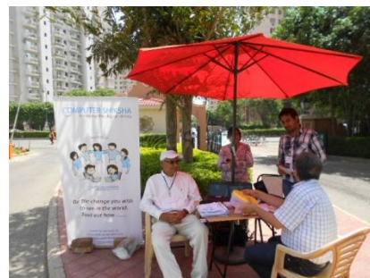
Winning Friends and Influencing People A small stall at DLF Carlton Estate. This is to publicize Computer Shiksha's work to include more and more people in this movement towards complete computer literacy