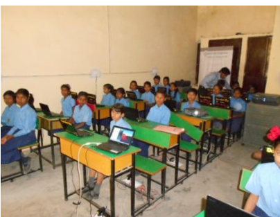
The first batch of children at Sankalp School, DLF Phase IV. Class size 30. Batch size 147.

Classes at Nai Kiran, Ardee City continue to go ahead full steam.