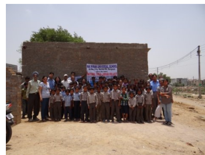
Learners Trainers Managers at the end of Module 1