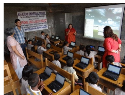
Our class size has increased to 26©