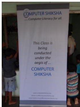
The standee which is put up at all our sites to identify computer lessons in progress.

trainers and are looking for a third to mitigate risks. In order to ensure that the classes have a least prescribed level of quality, Madhu Bahl is engaged in building the course material in a way that it makes it as trainer agnostic as possible. However the quality of delivery of the trainer has to be ensured which she does by personally mentoring the trainers with the help of Anshul Jain.