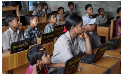
1 st batch of children of Nai Kiran start with Module 3 – Text processing