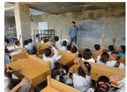
On Sundays enthusiastic volunteers coach the children (who are waiting for their turn) on other life skills like speaking in English.