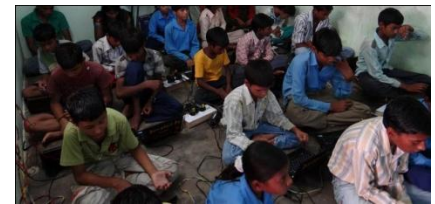
Children in “Umang” sit on the floor with their notebooks.

Besides Nai Kiran, Computer Shiksha added another partner school “Umang” run by BG Foundation. The foundation runs 5 community schools in Gurgaon and Umang is run from