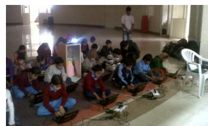
Children in Module I at the Guru Centre