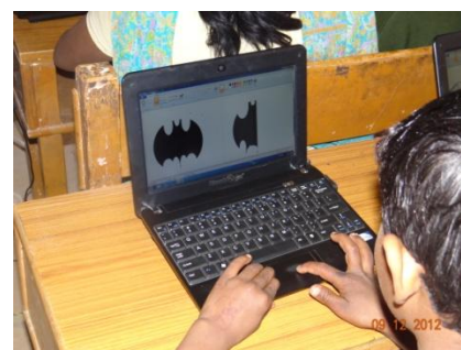
Children in Module II can draw this bat on MS paint! We bet many of our computer savvy readers will also not be able to make this!