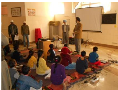
Inauguration of computer lessons at Guru Center at the DLF Phase I Gurudwara.

Computer Shiksha had started with 60 children on 5 th May 2012 at Nai Kiran School, Ardee City. After eight months on 9 th January Computer Shiksha started lessons at a second site. 27 children in a supplementary school (Guru Learning Centre) run at the DLF Phase I Gurudwara in Gurgaon. These children live in the vicinity and their parents are mostly employed by those living in the houses there. They go to regular school and come to the supplementary school to get help with their homework and also learn some life skills which are taught by experienced teachers in the supplementary school. The teachers say that taking computer lessons are a great way to equalize this divide between those who have and those who don't.