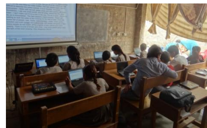
Children in Module 4 at Nai Kiran School, Ardee City, Gurgaon learning text processing.