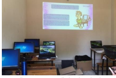
All equipment installed in the school