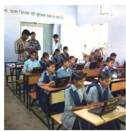
Computer classes on at Govt. Middle Schoo

We still struggle to meet our expenses month on month. We would be grateful if you could help us raise finance for running our operations. There are thousands of other kids waiting