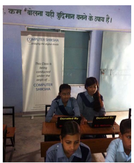
Computer classes on at Govt. Middle School