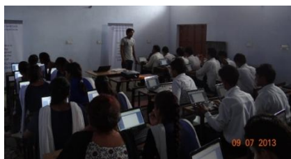
The first batch of students at the Govt. Secondary School, Chakkarpur. Class size 30.