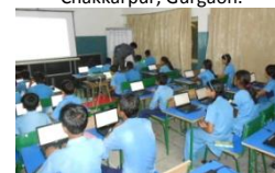
Students of Class III and IV at the Happy school, DLF Phase 1, Gurgaon.