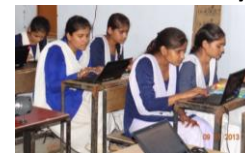
Class XII students at Govt. Secondary School, Chakkarpur, Gurgaon.