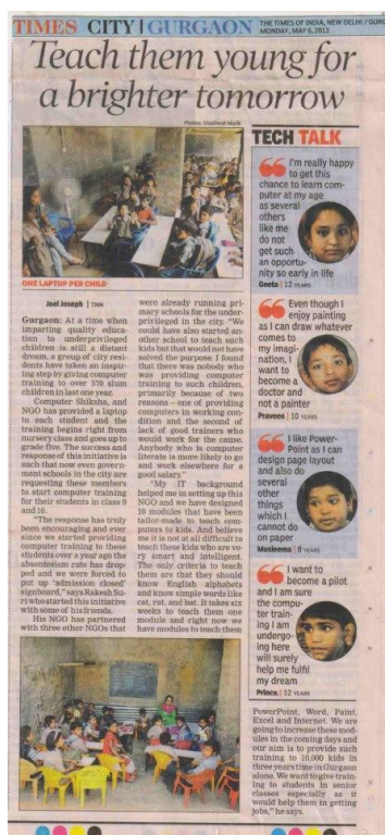
Computer Shiksha was written about in Times City, Gurgaon edition on 6 th May 2013.

The word about Computer Shiksha is spreading now. In the last three months we have found mention in a leading daily and on the web too. On 6 th May Times of India, Gurgaon City edition carried a feature. You will also find a citizen journalist's report on Computer Shiksha on iCNN too.