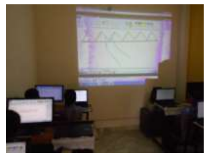
Kids learning in Bal Shiksha Kendra