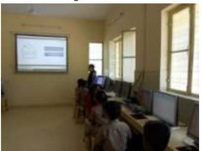
Kids learning in Pragati School