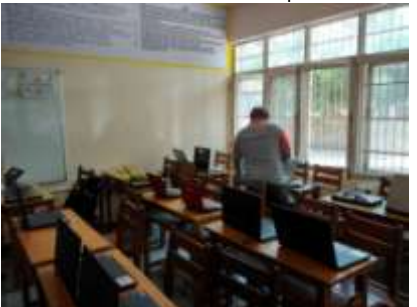
Computer Shiksha trainers do a final check of all the computers in the class before the first day's class gets kiced off