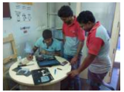
The Computer Shiksha team working on repairing old laptops.