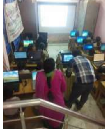
Classes on at Nai Kiran Ardee City.

In Model 1 we partnered with a mix of primary, middle and secondary schools but as we move ahead we are so glad that Computer Shiksha is reaching out