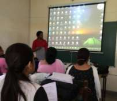
Train the trainers for partner organizations