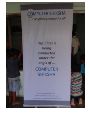
The standee which is put up at all our sites to identify computer lessons in progress.

trainers and are looking for a third to mitigate risks. In order to ensure that the classes have a least prescribed level of quality, Madhu Bahl is engaged in building the course material in a way that it makes it as trainer agnostic at possible. However the quality of delivery of the trainer has to be ensured which she does by personally mentoring the trainers with the help of Anshul Jain.